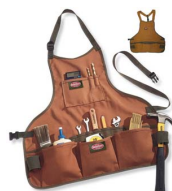
16 pkt Super Bib Apron $19.53 - $13.95 Save: 29% off